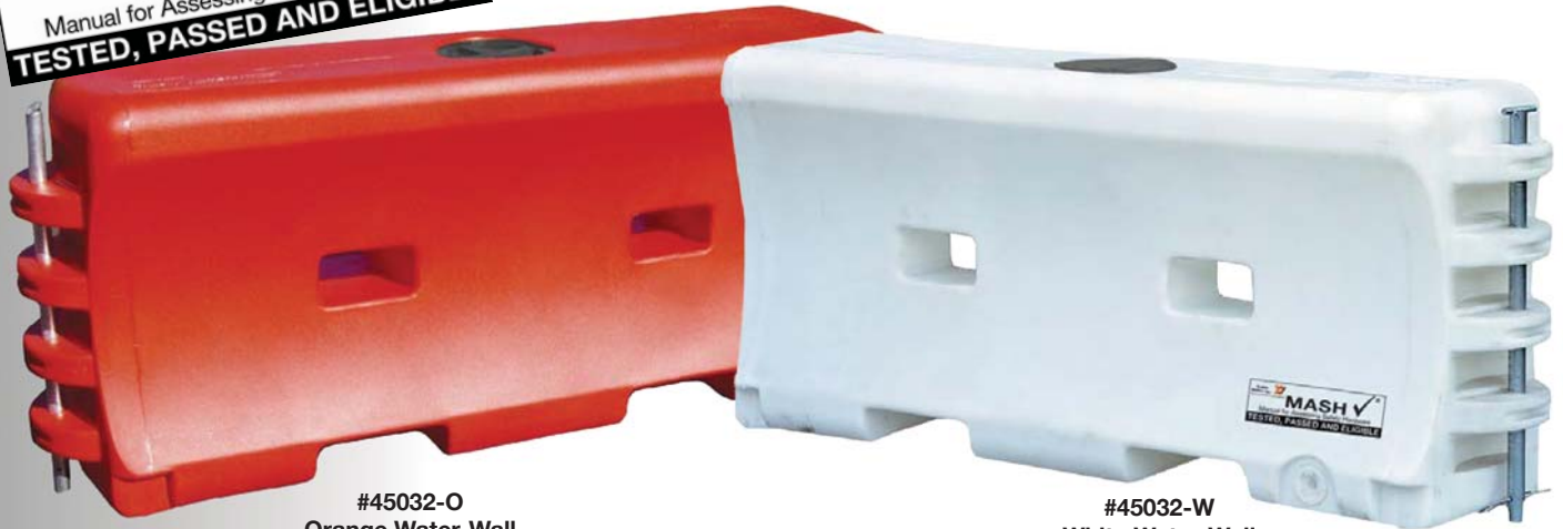
#45032-O Orange Water-Wall