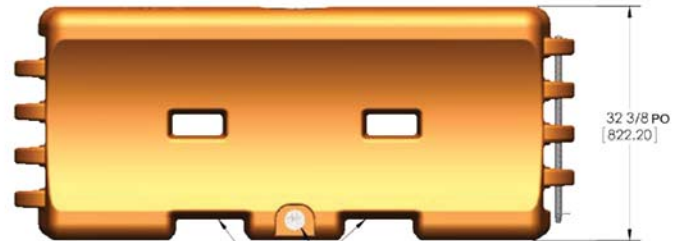
TROUS POUR CHARIOT ÉLEVATEUR TROU DE VIDANGE AVEC FILETAGE RENFORCÉ