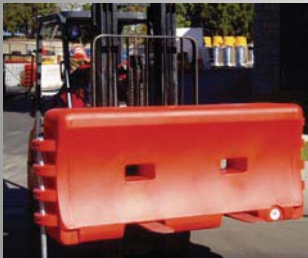
Water-Wall can be easily lifted and placed using a forklift or pallet jack