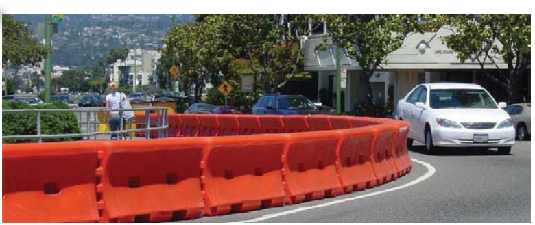
30-degree pivoting hinge design allows the TraFFix Water-Wall to handle curved roads