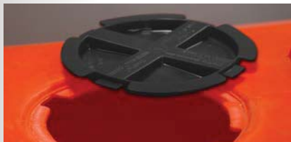
Large 8" fill hole speeds filling process, includes twist-lock plastic cap