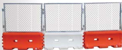
Water-Wall Fence can be easily attached to Water-Wall for additional job-site security.