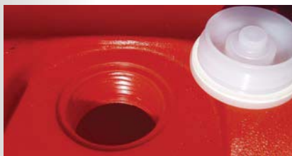
New tamper resistant, offset drain plug with coarse buttress thread