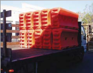
Water-Wall stacks for storage and transportation

Water-Wall to be 72" long x 32" tall x 18" wide and molded from linear low density polyethylene. Water-Wall to be MASH Eligible as a Longitudinal Channelizing Device, TL-2. Individual wall shall weigh 80 lbs. empty and 1,110 lbs. filled. Standard colors are white or orange. Water-Wall sections are connected together with galvanized steel T-pins passing through a double wall knuckle which minimizes breakage at hinge points. Wall shall pivot up to 30 degrees when connected. Water-Wall to have one 8" diameter fill hole for quick fill and a twist lock cap for closure. Water-Wall will have molded through holes to provide easy movement. Drain plug to be offset to protect against cracking or breaking and have coarse buttress threads for quick removal and attachment. Water-Walls shall stack for easy movement and storage.