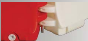
Water-Wall can pivot 30-degrees and be locked together with steel connection pins