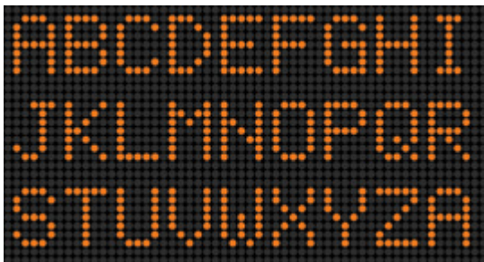
Default 5x7 font (up to 9 characters)